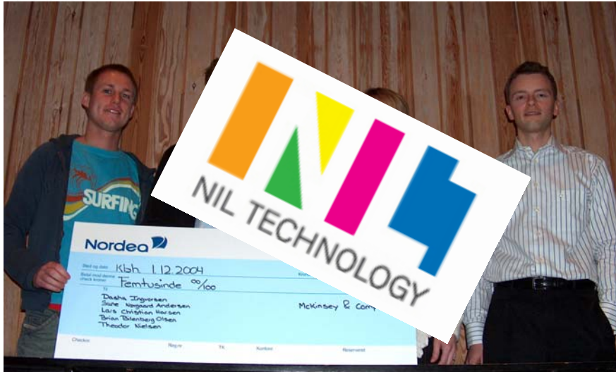
13 DTU Management Engineering, Technical University of Denmark