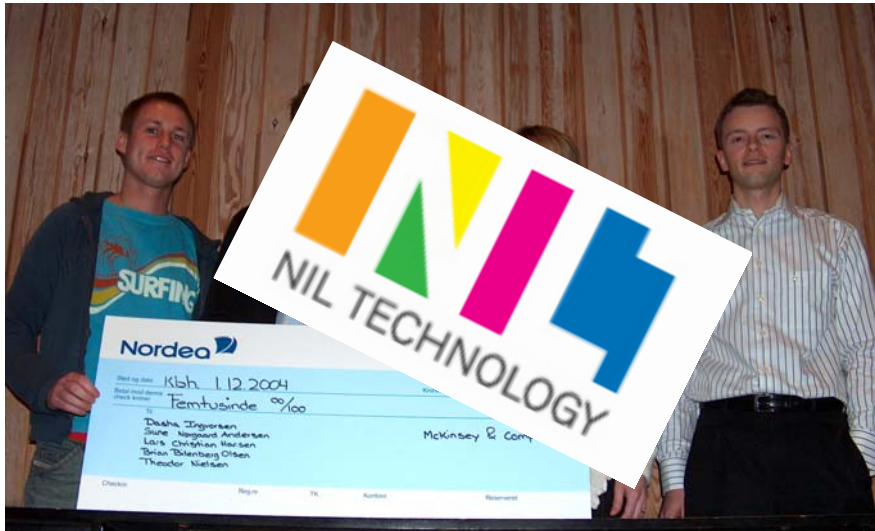
13 DTU Management Engineering, Technical University of Denmark